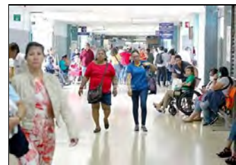
Caja - Hurry up and Wait.