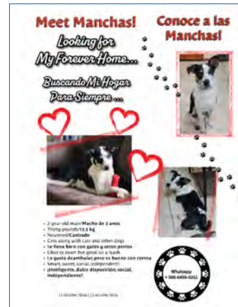
This sweet boy is looking for his forever home! Whatsapp 6439-0201