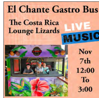
Avenue 3 in Grecia, look for the Big New Imperial sign!