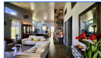
New Real Estate listings in Atenas!