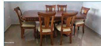
Almost new! - Cenizaro wood dining set