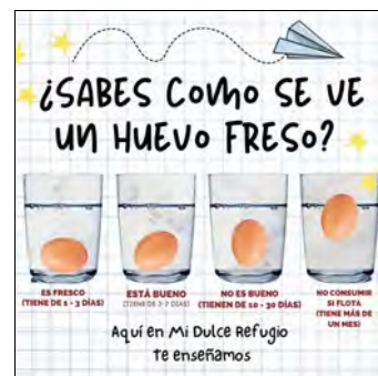
Local Alert about eggs - be sure yours are fresh, watch out for discounted prices.