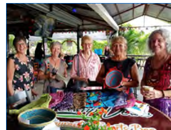
Blooms invites you to get social! Monthly meetings in the Western Central valley.