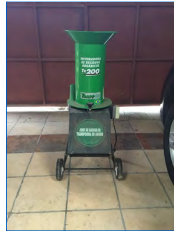
Electric yard waste shredder, in Items for Sale!

You can start paying Marchamo at any bank, credit union, or INS office beginning 1 November. The insurance fee must be paid no later than 31 December. Remember, there is no grace period and the transit police will be out in force beginning 1 January to catch laggards. As an aside about the transitos, they are also looking at everyone for any violations that will pull in funds. A friend of QPG recently was stopped by a roadside transit set up and fined USD$50 when it was found that her required fire-extinguisher was out of charge date. Be safe - check the date on yours. It’s under 10 mil to get it recharged.