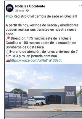
New Registro office in Grecia