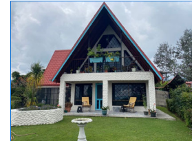
Chalet House in Cajon Arriba Now Available for Rent! Click on photo to view page.