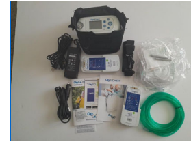
Portable Oxygen Concentrator in our For Sale section

It's quite pleasant to replace the very hot temperatures of the past Dry Season. Predictions for our rainy season, which appears to have begun, have the current El Niño dissipating and seeing the onset of a La Niña condition. In the past, this has meant increasing wet for our upcoming Green Season. Now, due to climate change, meteorologists are hedging their bets a bit, but it is still likely that it will be wetter in the latter