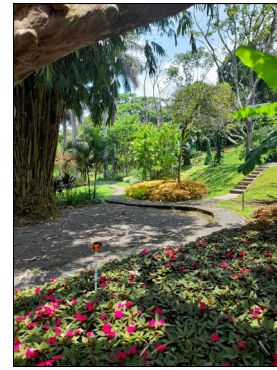
Else Kientzler Botanical Garden in Sarchi awaits you!