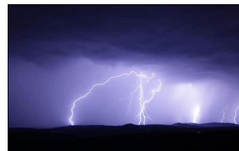
Take steps now to mitigate lightning damage.