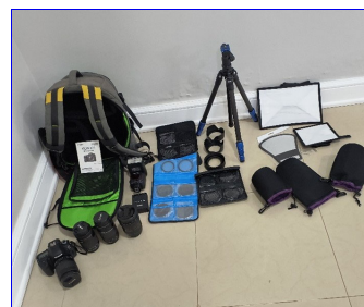
Your new hobby awaits!