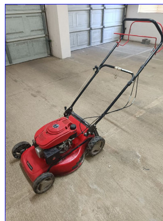
Almost New Lawnmower - 16"!