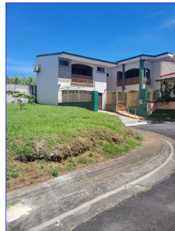
For Sale - Beautiful home on a quiet street, 10 minute walk to downtown Grecia!