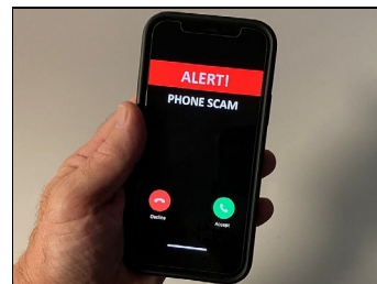
Your bank will NEVER call asking for your private information. Neither will Social Security or the IRS.