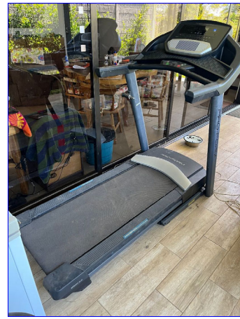
Pro Form Sport Treadmill! Like new...

Diseases and Airborne Viruses – Due to an outbreak in Columbia, a yellow-fever vaccination 10 days prior to exiting Costa Rica for everyone travelling there (citizens, residents,