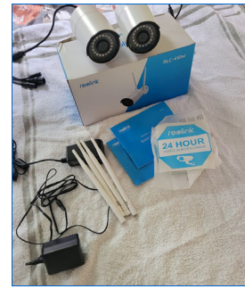
Lots of new listings of items for sale!

Venezuela News According the international community, the recent national presidential election in Venezuela showed the opposition candidate, easily won. Maduro’s government immediately declared Maduro the winner. Most industrialized countries have recognized the opposition and called on Maduro to resign. However, an official election monitor, an American from Costa Rica that I spoke to this weekend said at the sites she monitored, the election was fair and legal and that the official polling data she saw indicated that Maduro, in fact, did win. The official outcome is being left up to the Venezuelan Supreme Court to review, but the opposition that is in hiding is not fully cooperating with the review according to the monitor that I spoke to. I guess, not everything is