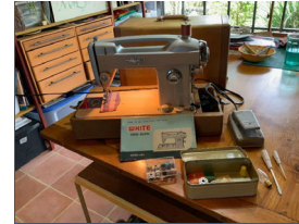
Vintage White brand Sewing Machine for Sale!