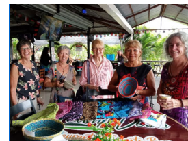
Blooms invites you to get social! Monthly meetings in the Western Central valley.