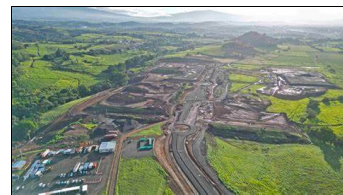
Evolution is Here. Will an AutoMercado be enough to make it palatable to the community?