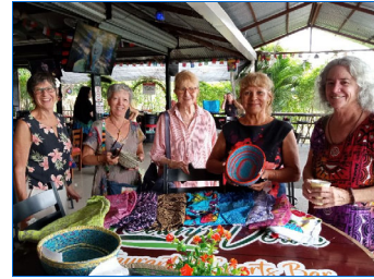
Blooms invites you to get social! Monthly meetings in the Western Central valley.

Due Soon 'Tis the season for annual payments. Marchamo , the road tax-insurance for all vehicles must be paid before 31/12/2024 (payable at INS offices and most banks). Property taxes are due beginning 1 January through the first quarter of