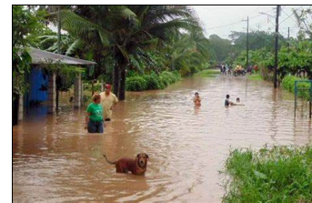
You can send donated items or cash to Assn. Obras del Espiritu Santo of Costa Rica, contact info on FaceBook .