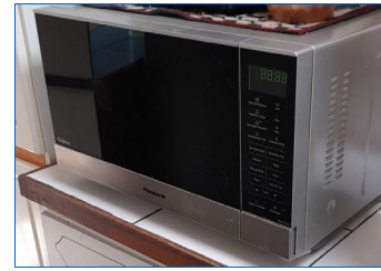
Microwave, refrigerator, single bed, all new listings under Items for Sale!

There are two "fees" that count toward the total that residents will experience moving from 'Temporary' to 'Permanent' resident: a processing fee and a 'deportation' fee. These fees have increased since I became a permanent resident, but there is something a bit unusual that I discovered while researching this change. The 'deportation'