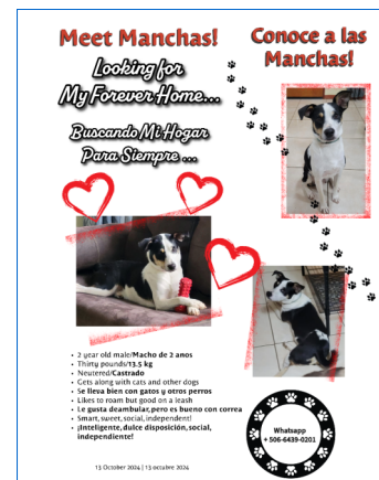
This sweet boy is looking for his forever home! Whatsapp 6439-0201