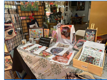
The Costa Rica Lounge Lizards will be playing at the Atenas Art and Craft Fair December 6, 6pm, Hotel Colinas del Sol.