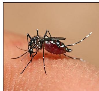
The characteristic symptoms of mild dengue are sudden-onset fever, headache (typically located behind the eyes), muscle and joint pains, nausea, vomiting, swollen glands and a rash. If this progresses to severe dengue the symptoms are