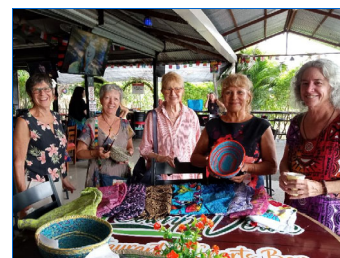
Blooms invites you to get social! Monthly meetings in the Western Central valley.