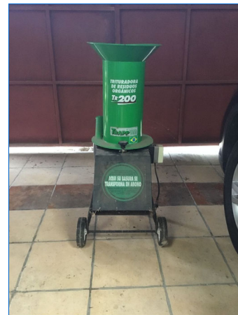
Electric yard waste shredder, in Items for Sale!

You can start paying Marchamo at any bank, credit union, or INS office beginning 1 November. The insurance fee must be paid no later than 31 December. Remember, there is no grace period and the transit police will be out in force beginning 1 January to catch laggards. As an aside about the transitos, they are also looking at everyone for any violations that will pull in funds. A friend of QPG recently was stopped by a roadside transit set up and fined USD$50 when it was found that her required fire-extinguisher was out of charge date. Be safe - check the date on yours. It's under 10 mil to get it recharged.