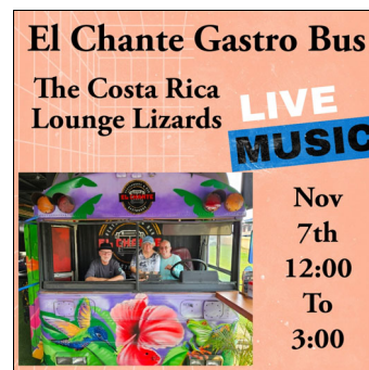
Avenue 3 in Grecia, look for the Big New Imperial sign!