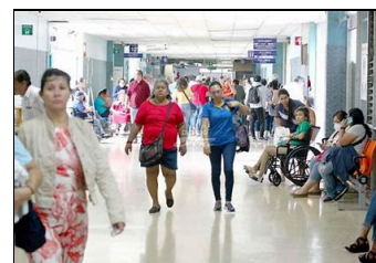
Caja - Hurry up and Wait.