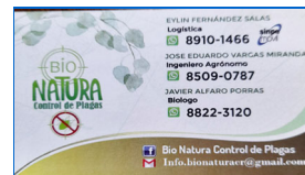
Take the BioNatura way to non-chemical pest control!