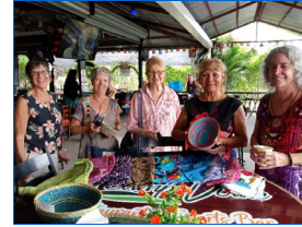
Blooms invites you to get social! Monthly meetings in the Western Central valley.

swollen glands and a rash. If this progresses to severe dengue the symptoms are severe abdominal pain, persistent vomiting, rapid breathing, bleeding gums or nose, fatigue, restlessness, blood in vomit or stool, extreme thirst, pale and cold skin, and feelings of weakness.