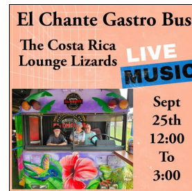
Avenue 3 in Grecia, look for the Big New Imperial sign!