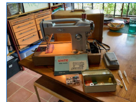
Vintage White brand Sewing Machine for Sale!