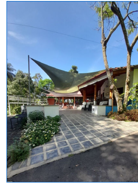
The Restaurant at Sarchi Botanical Gardens

Cartel Crime Still Ticking Up The government is dedicating more resources to thwart the increase in cartel-based gang crimes and is getting help from the U.S. Coast Guard and other outlets. Cartel bigwigs have been apprehended and large quantities of drugs have been intercepted, but now the cartels seeing Costa Rica as not only a hub for distribution of